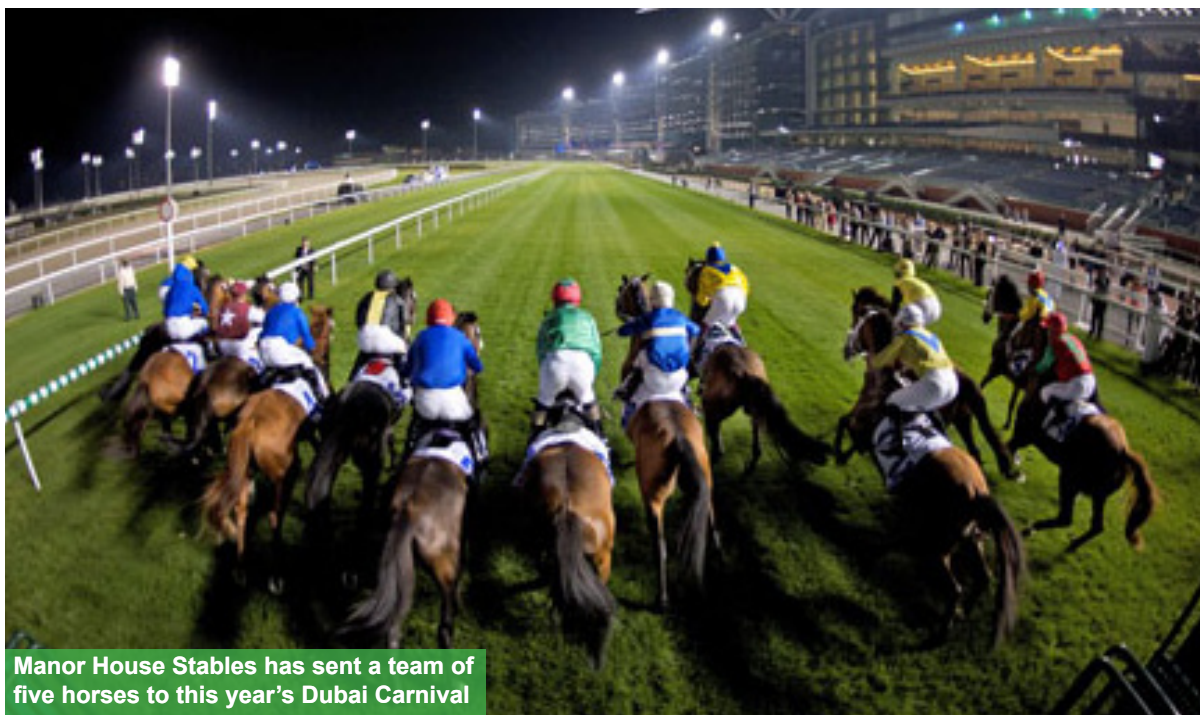
Manor House Stables has sent a team of five horses to this year's Dubai Carnival