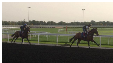
The horses working at Meydan

Bear Behind's blinding early speed has seen him finish a close-up third in two 5f handicaps, earning almost £20,000 in the process. Alas, as you might imagine, the races are fiercely competitive and it's incredibly tough to make all.